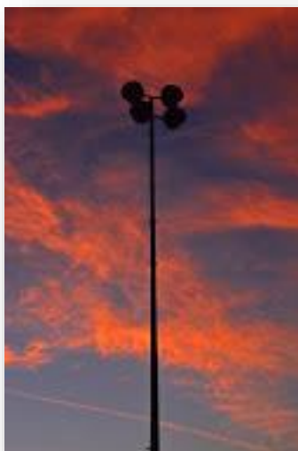
THE WRITE SHOT