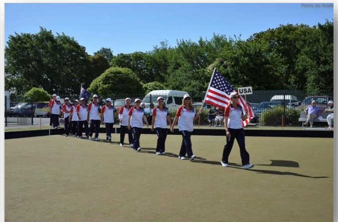
Opening Ceremony - 18 Countries