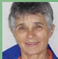
de la Garza