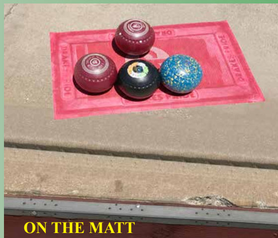
ON THE MATT