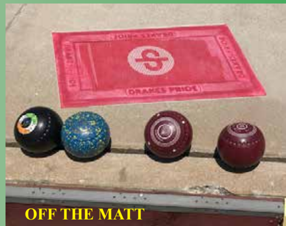
OFF THE MATT